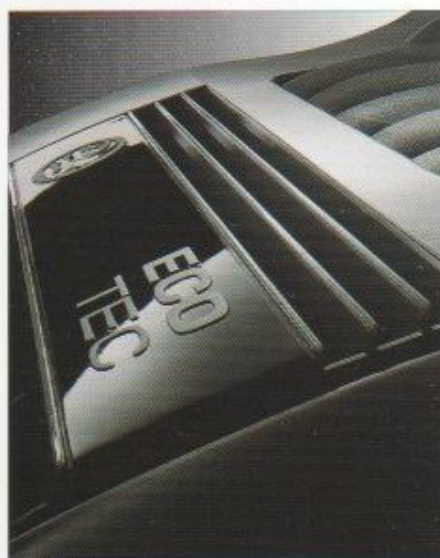
2.5i V6 24v engine.