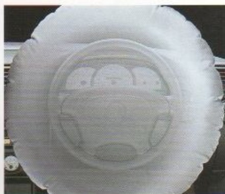
Driver's full-size airbag.