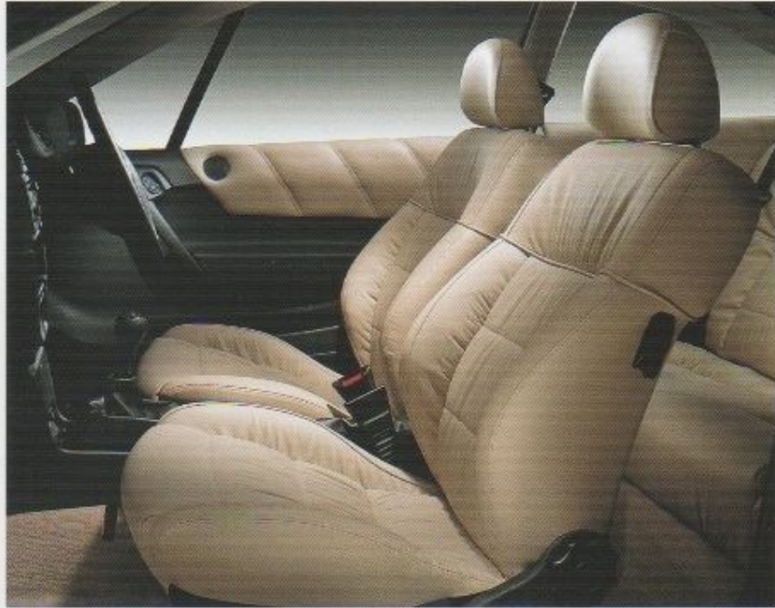
Cream leather interior.