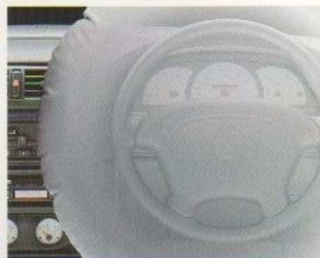
Driver's full-size airbag