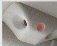
Ultrasonic alarm sensor