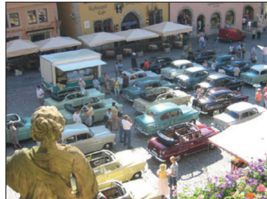
Type Section Meeting

Adam Opel started his business initially with the production of sewing machines and bicycles. Later on his sons produced motor cars as well. The Opel brothers were involved in the development of rocket technics. Aircraft engines, motorcycles and refrigerators were also produced. Because of this various types of Opel products and Opel automobiles we have organized our clubs into type-sections in order to serve the members to the best of the knowledge. Each type-section is run by a specialist, a member who has the best knowledge on that particular Opel product. Every member should address the problems he has on his Opel product to his relevant specialist. Right now we have 46 type-sections listed.