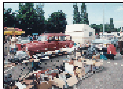
Spare Part Trade Market

Are you looking for Opel oldtimer spare parts or do you want to offer some? There we provide in our Clubmagazin a section "Market". Free of charge members can place an advertisement. The more superior possibilities are our Opel spare part trade markets held two times a year, in March and September, in front of the Opel Factory in Ruesselsheim, Germany. There will be exclusively offered spare parts for Opel oldtimer only.